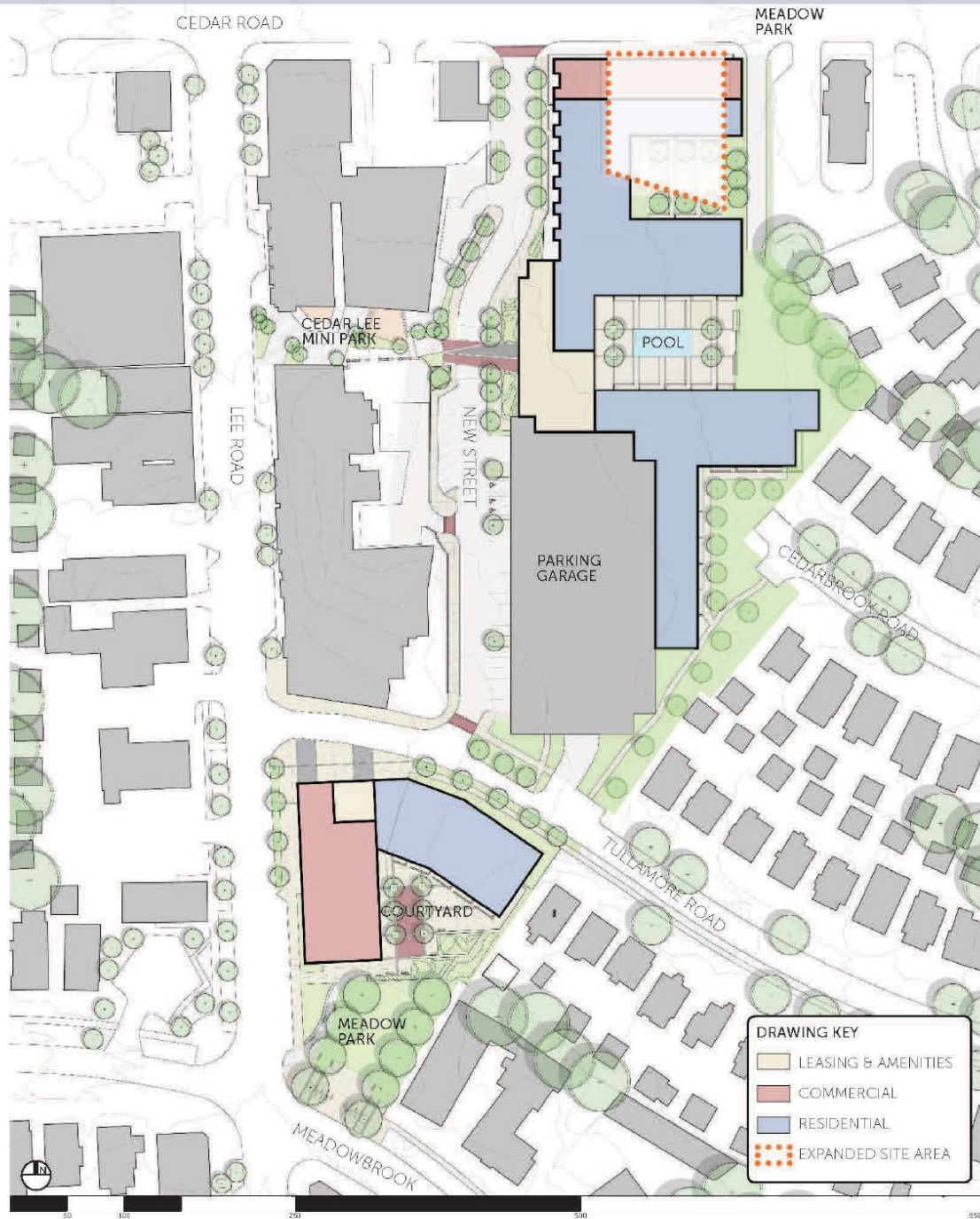
CEDAR-LEE-MEADOWBROOK CONCEPTUAL EXPANDED SITE PLAN - 2 ADDITIONAL SITES (CUT BEAUTY SCHOOL & HEIGHTS ANIMAL HOSPITAL)

FLAHERTY & COLLINS PROPERTIES CITY ARCHITECTURE