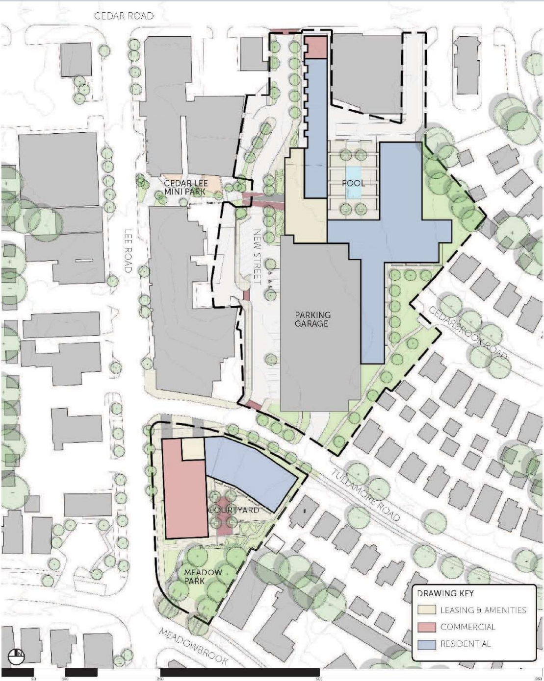
CEDAR-LEE-MEADOWBROOK CONCEPTUAL SITE PLAN

FI AHERTY & COLLINS PROPERTIES CITY ARCHITECTURE