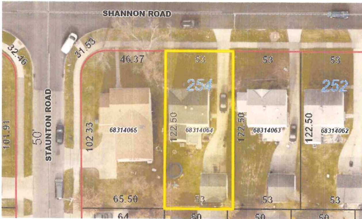
2 Aerial Photo - Existing A-1 N.T.S.