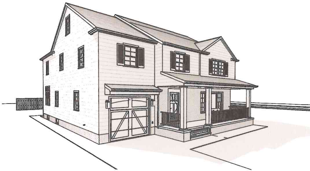
1 Front Perspective A-1