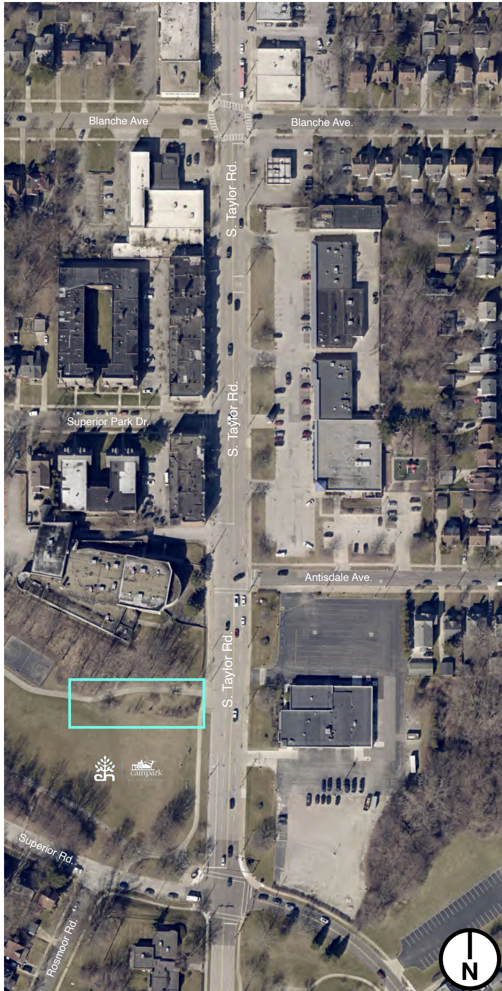
Exhibit A: Aerial of Stramp Location