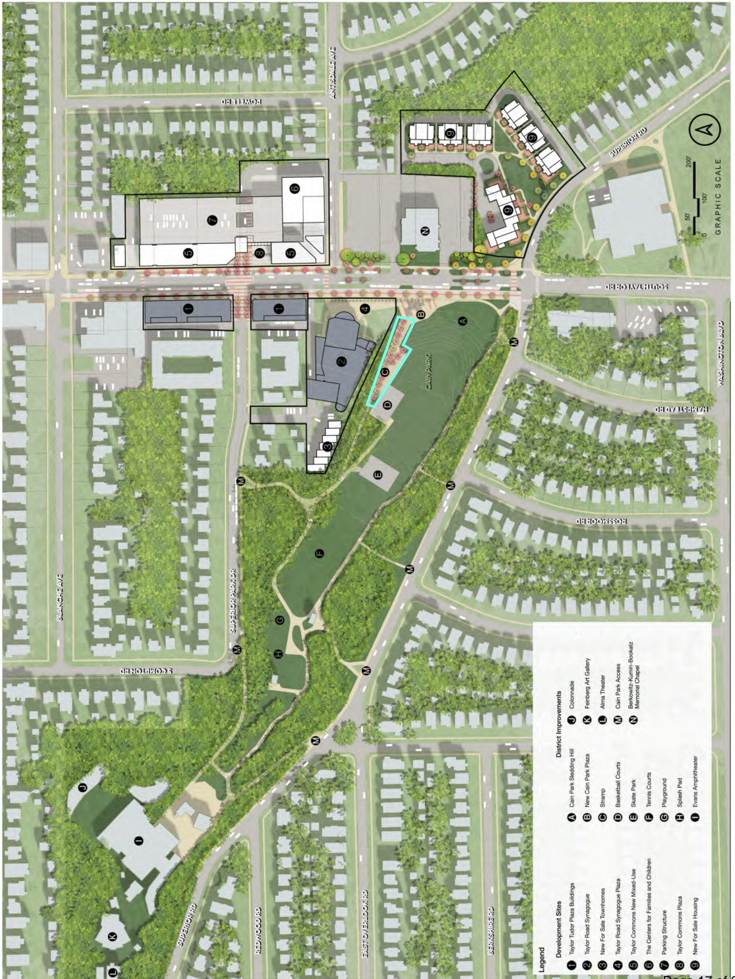
Exhibit C: Cain Park Village Site Plan With Stramp Highlighted