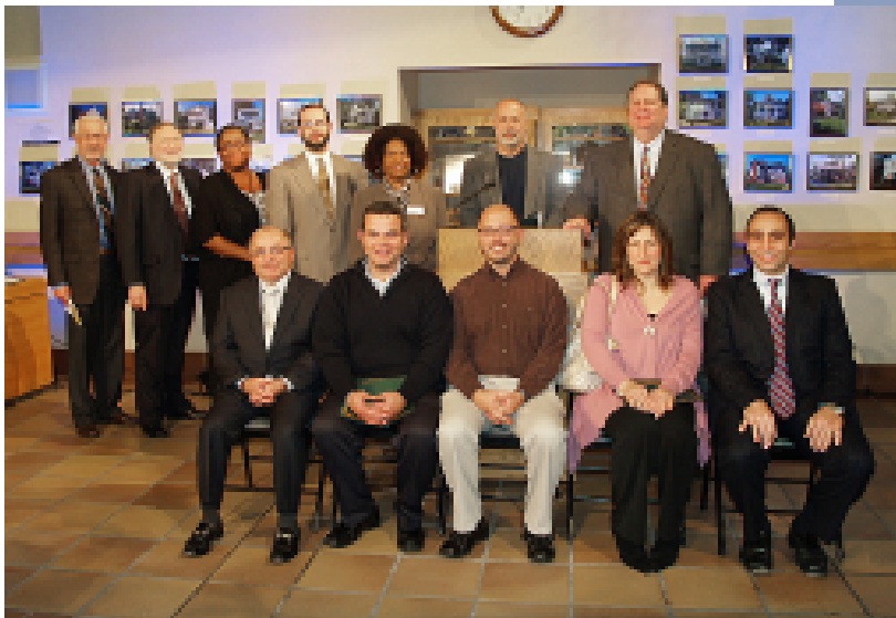
● Historic Preservation winners with Council