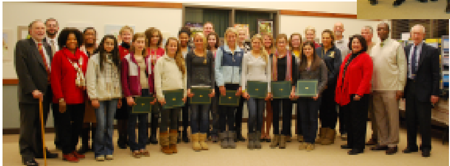
● Beaumont Cross Country and Tennis Teams with Coaches and Council