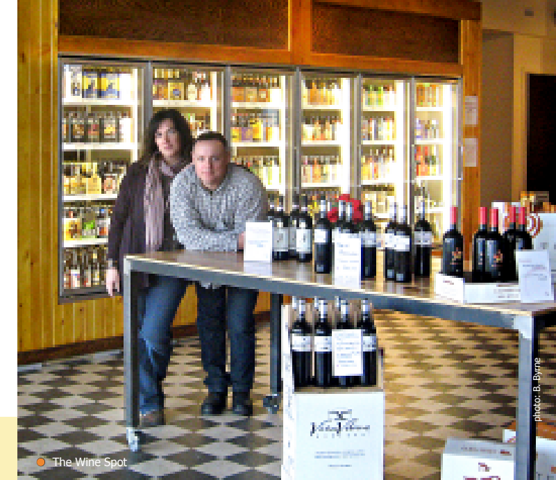
● The Wine Spot