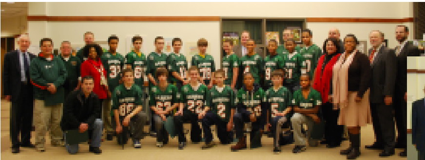
● Communion of Saints Football Team with Coaches and Council