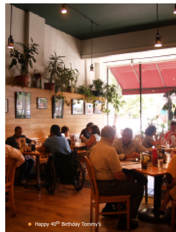
● Happy 40 th Birthday Tommy's

Citizens may vote for their favorite Heights businesses in FutureHeights' annual Best of the Heights awards program. The 2012 survey begins May 1 and runs through August 31. Ballots are available on the back page of the May through August issues of the Heights Observer , at Heights independent businesses and at www.futureheights.org . The winners will be announced at an awards ceremony in the fall. For more information, call 216-320-1423 or visit www.futureheights.org .