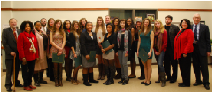
● Heights High Women's Soccer Team and Coaches with Council