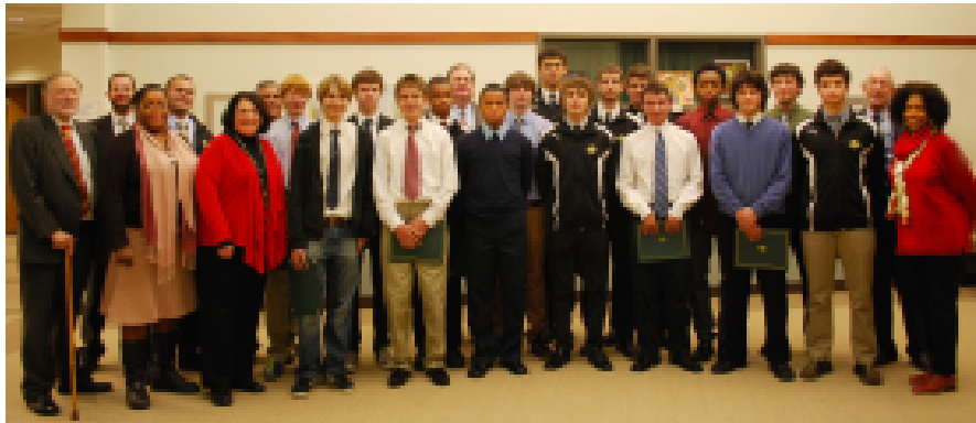
● Heights High Men's Soccer Team and Coaches with Council