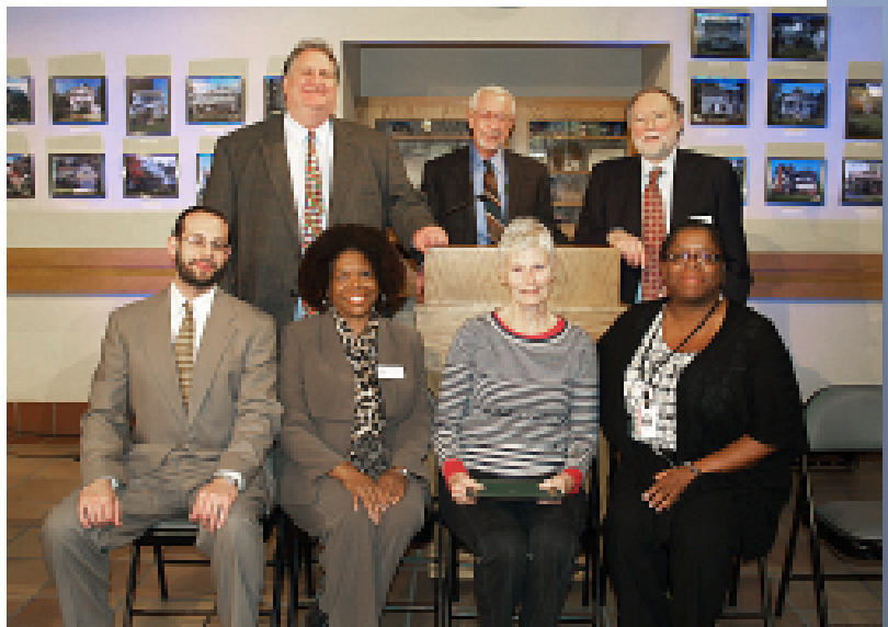
● Sustainability Award winner with Council