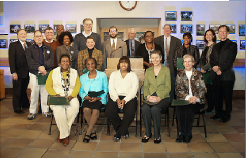
● Tender Loving Care winners with Council