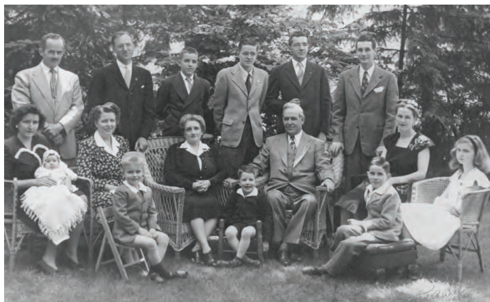
Mayor Frank Cain family portrait, 1946