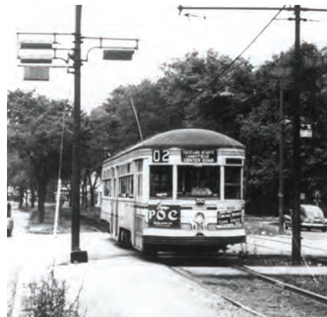
Streetcar at Euclid Heights Blvd./ Derbyshire, 1948