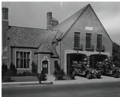
Left Top: Heights Noble Road Fire Station, ca 1932

In 1921 Cleveland Heights was established as a city. From our early days, diversity and creativity have been cherished traits. People of all races, religions and economic backgrounds have always been welcomed. A strong sense of community so often differentiates us from other cities. Whether it was fighting to protect Shaker Lakes from being paved over to become a highway or being one of the first cities to honor domestic partners, Cleveland Heights remains a unique and progressive place to live. Stay tuned for special activities to be announced to celebrate our Centennial. For more information go to www.ClevelandHeights100.com .