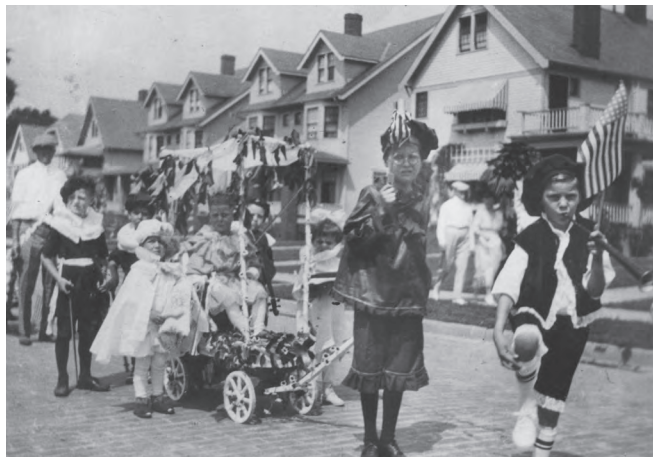
4th of July on Sycamore Road, 1925