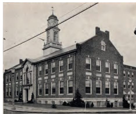
City Hall, 1924